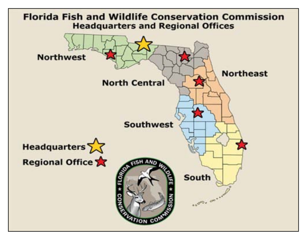
Figure 4.1 FWC Headquarters and Regional Offices

Figure 4.1 shows where headquarters and regional offices for the FWC are located throughout the state of Florida. For more information about Florida Fish and Wildlife Conservation Commission, please visit the website at <a href="http://myfwc.com/">http://myfwc.com/</a>.